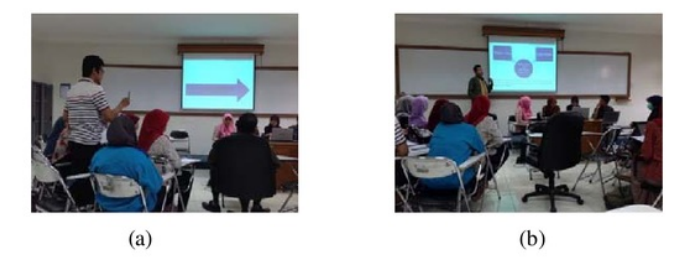
Figure 2. (a) Students had presentations and discussions, (b) the lecturer gives confirmations